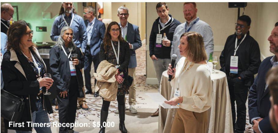
First Timers Reception: $5,000