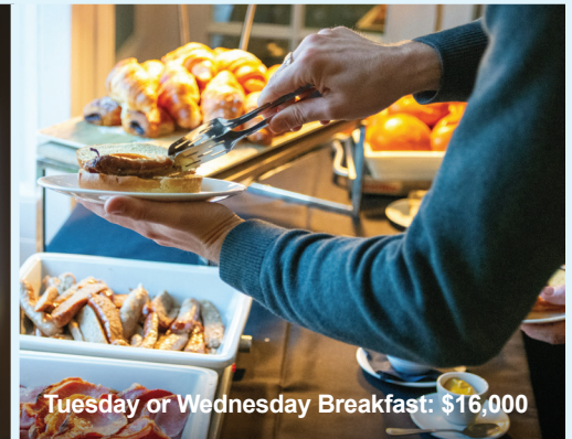
Tuesday or Wednesday Breakfast: $16,000